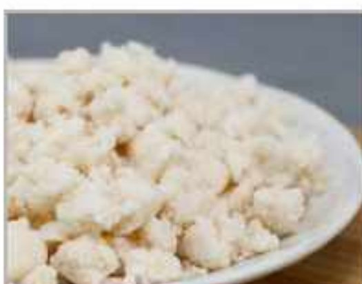
OKARA-SOY BEAN PULP