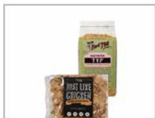
TVP- TEXTURED VEGETABLE PROTEIN