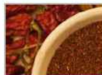
CHIPOTLE & ANCHO CHILI PEPPER