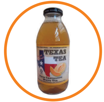
Texas Tea Pecos Cantaloupe White Tea