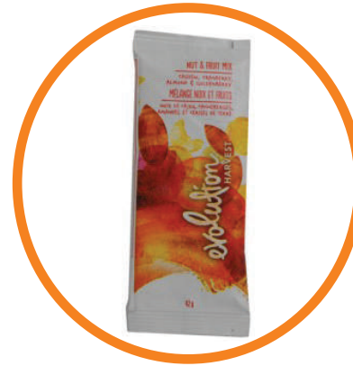
Evolution Harvest Cashew, Cranberry, Almond & Goldenberry Mix