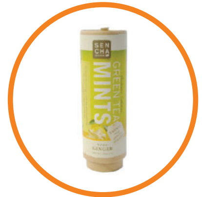
Sencha Naturals Green Tea Mints Yuzu Ginger Mints