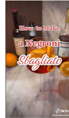
@jujimakessdrinks Negroni Sbagliato - TikTok