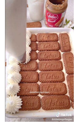
@littleblogofvegan Biscoff Tiramisu - TikTok