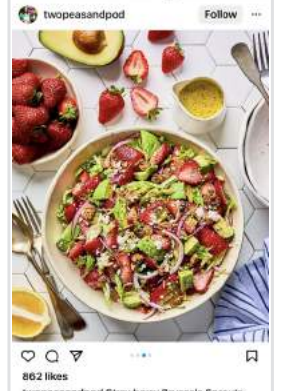
862 likes twopeasandpod Strawberry Brussels Sprouts Salad-shaved Brussels sprouts salad with strawberries, avocado, candied pecans, feta, red