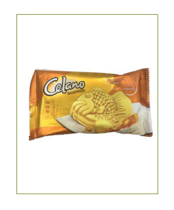
KONJAC PEARL COCONUT CALAMANSI TAIYAKI ICE CREAM: this product features coconut ice cream, pastry, chewy and crunchy pearls and a calamansi sauce. | Vietanam