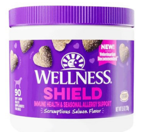
Wellness Shield supplements for immune health and seasonal allergies, salmon flavor