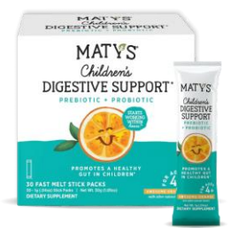
Maty's Children's Digestive Support Orange