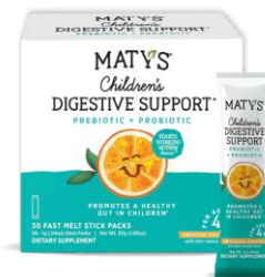
Maty's Children's Digestive Support Orange