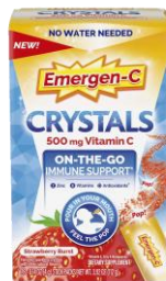
Emergen-C Crystals Strawberry Burst