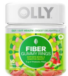
Olly Fiber Gummy Rings Strawberry Watermelon

Did this spark inspiration flavoring your next product? Request a sample here!