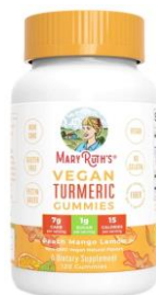
Mary Ruth's Vegan Turmeric Gummies Peach Mango