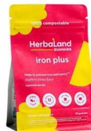
HerbaLand Naturals Iron Plus Gummies Raspberry Lemon