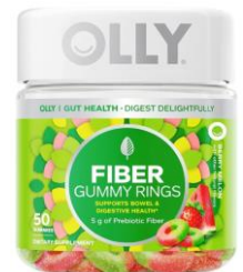
Ollly Fiber Gummy Rings Strawberry Watermelon

Did this spark inspiration in flavoring your next product? Request a sample here!