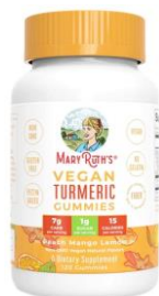
Mary Ruth's Vegan Turmeric Gummies Peach Mango