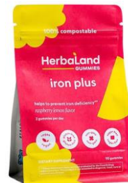
HerbaLand Naturals Iron Plus Gummies Raspberry Lemon