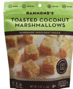
HAMMONDS Toasted Coconut Marshmallows Canada, May 2023