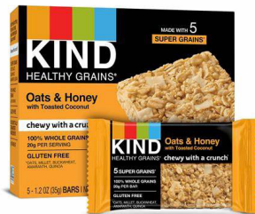
KIND Toasted Coconut Oats and Honey Granola Bars U.S. Dec 2023