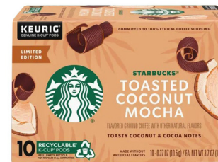
STARBUCKS Limited Edition Toasted Coconut Mocha Flavored Ground Coffee in Pods U.S. March 2024

Top launch categories include cereal & energy bars, confections, coffee, cakes, and cookies. Toasted coconut can be found paired with flavors such as chocolate, peanut butter, caramel, honey, and almond.